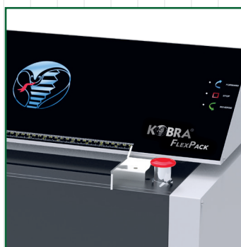
Touch Screen Panel