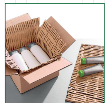
Padding mats from corrugated cardboards